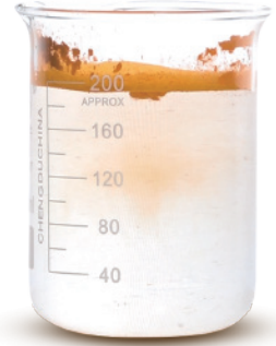
Curcumin from In . brand

High water dispersibility helps drive greater bioavailability which makes CuminUP60® the most effectively potent easily integrated curcumin product available.