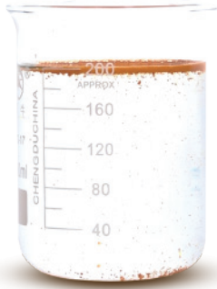
Regular 95% Curcumin