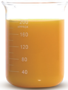
CuminUP60® from Chenland